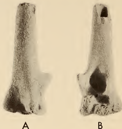
Fig. 2. Distal end of right humerus of Fulmarinae, gen. et sp. indet., MBD334. A. Caudal aspect. B. Cranial aspect. \times 2 .

the one hand, and the larger Fulmarus - Thalassoica on the other. Of these genera, it is more similar to Daption in not having the brachial depression extending as far proximally. It differs from these genera, as well as from Pagodroma , Halobaena , and Pachyptila , in the shape of the ectepicondylar spur and in the deeper brachial fossa. If correctly referred to the fulmarine petrels, this specimen would represent a species in a size-class that has become extinct. A coracoid from Langebaanweg may also be referable to this species because it is too large for the largest species of Pachyptila yet is not referable to the genus Puffinus or any of its close relatives (Olson 1985).